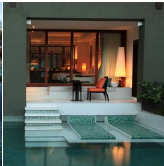
Deluxe Pool Access