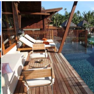
Deluxe Pool Suite