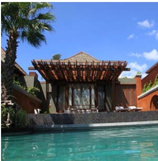
Mai Pool Villa